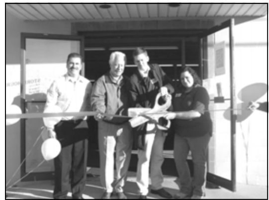
Patuxent Habitat for Humanity celebrates the grand opening of their new store in North Beach.