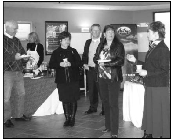
Members of the Lead Share group enjoy a holiday celebration while helping to stock the End Hunger in Calvert County food bank.