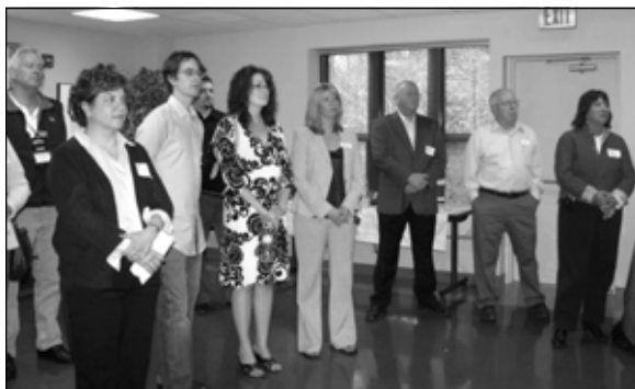
The April BAH at The ARC of Southern Maryland gave Chamber Members a chance to hear about programs and services that are offered to children and adults with intellectual and developmental disabilities.