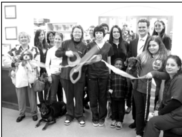
The Prince Frederick Animal Hospital proudly celebrated their new location with a ribbon cutting on April 9th. Staff and two and four legged patrons were all smiles as the ribbon was cut.

Whether you are just starting your business or have decades of professional experience, there are many ways to get engaged as a member of the Calvert County Chamber of Commerce.